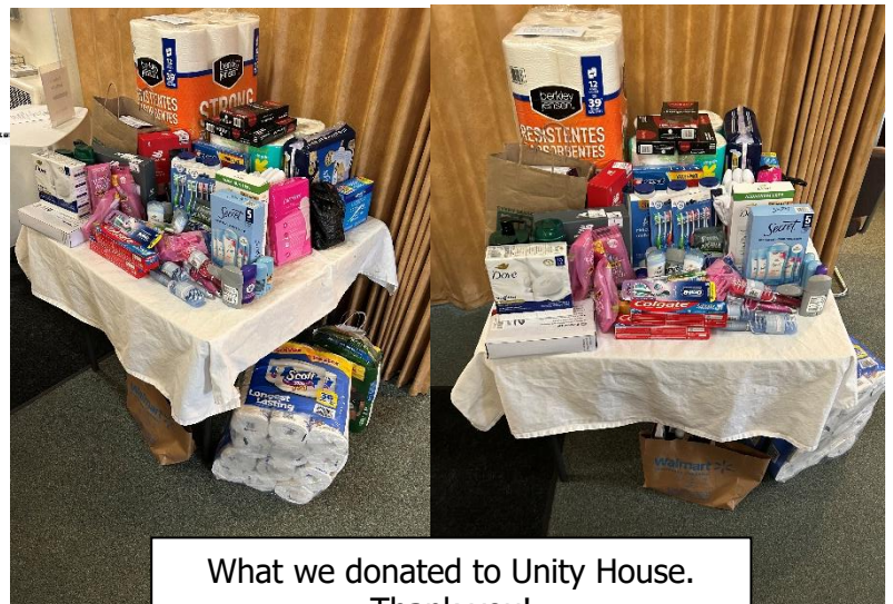
What we donated to Unity House. Thank you!